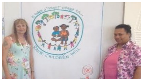
Biddy catches up with United Synergies' Family Support Worker - Melba Townsend